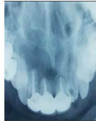
Figure 2 Occlusal radiograph after filling canals. Arrows refer to the border of the cyst

First, we retreated the mentioned teeth and filled canals with gutta percha at the time of surgery (Figure 2).