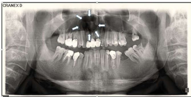
Figure 1 Panoramic radiograph. Arrows refer to the border of the cyst

A male Patient aged 35years reported to the department of Oral Surgery with a chief complaint of pain, swelling and pus discharge in upper right front region of mouth for two months. On panoramic examination, there was large periapical radiolucency in relation to 11, 12 (Figure 1).