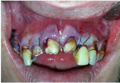
Figure 5 The suture

The wound was primarily closed with 4-0 silk sutures (Figure 5).