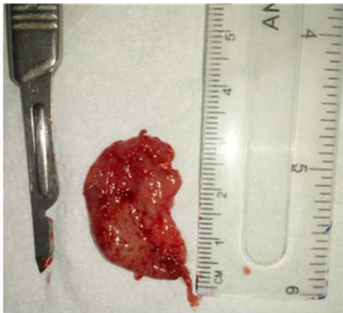
Figure 6 The whole cyst

Histopathologically revealed presence of varying thickness of epithelium with fibro cellular connective stroma. At higher magnification, the epithelium was disrupted with infiltration of chronic inflammatory cells along with vacuolations within the epithelium. Connective tissue showed dense infiltration of lymphocytes and plasma cells with few macrophages (Figure 7). A diagnosis of radicular cyst was given.