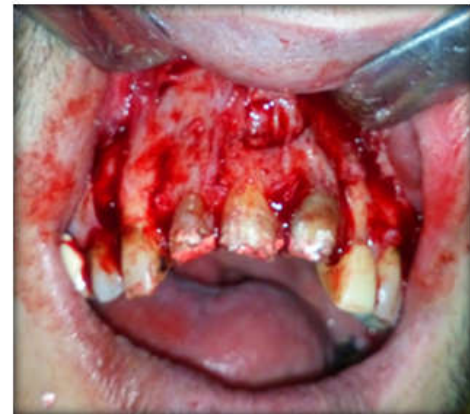
Figure 3 Mucoperiosteal Flap

A full thickness mucoperiosteal flap was reflected. After uplifting the mucoperiosteal flap, a cortical perforation of the buccal cortex of the maxilla could be seen, as well as the membrane of the radicular cyst (Figure 3).