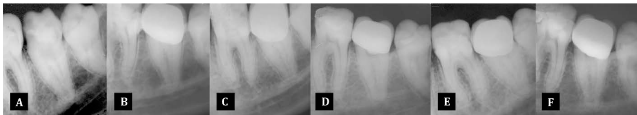
Figure 2. Periapical diagnostic and follow up radiographs of tooth 37: A) diagnostic radiograph showing a secondary caries under a composite restoration; B) 3 months after MTA pulpotomy radiograph after crowning the tooth; the periapical structure appears normal and; C-F) normal periapical structures upon radiographic follow-up visits at 12, 24, 36 and 42 months, respectively